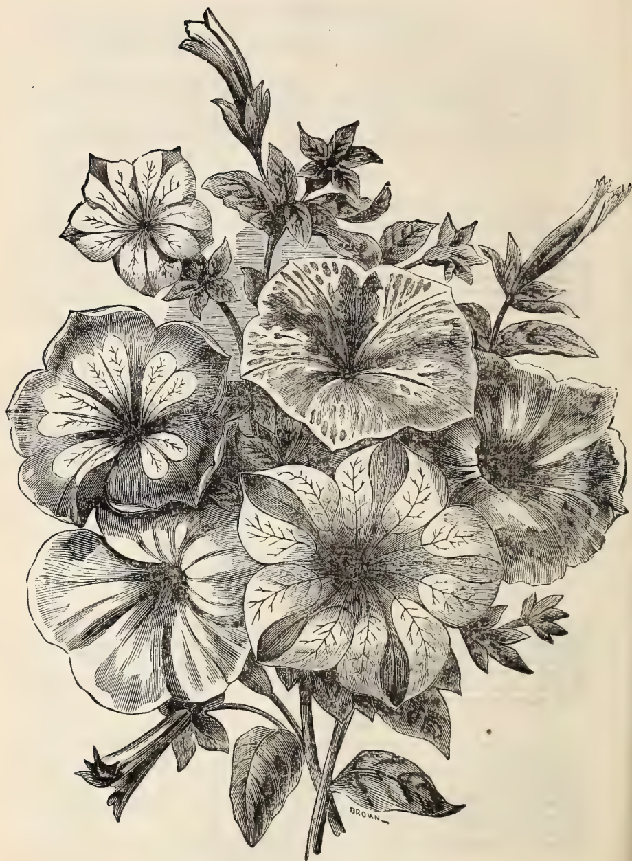
PETUNIA. Page 43.